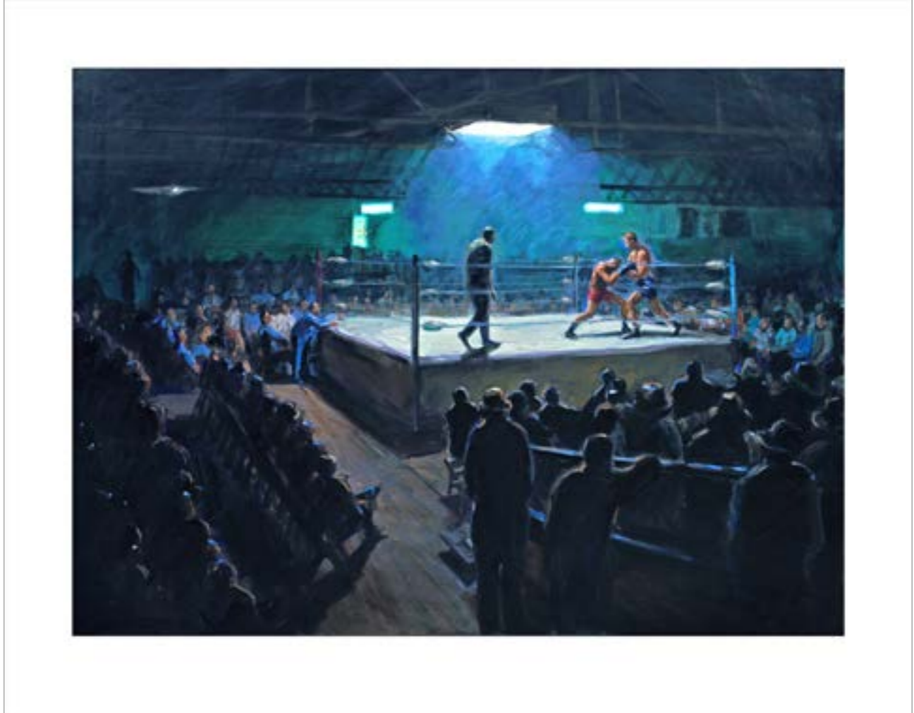
Prize Fight Limited Edition Graphics of 295 • Paper Size 40" x 31½" (102cm x 80cm) • Image Size: 34" x 25" (86cm x 64cm)