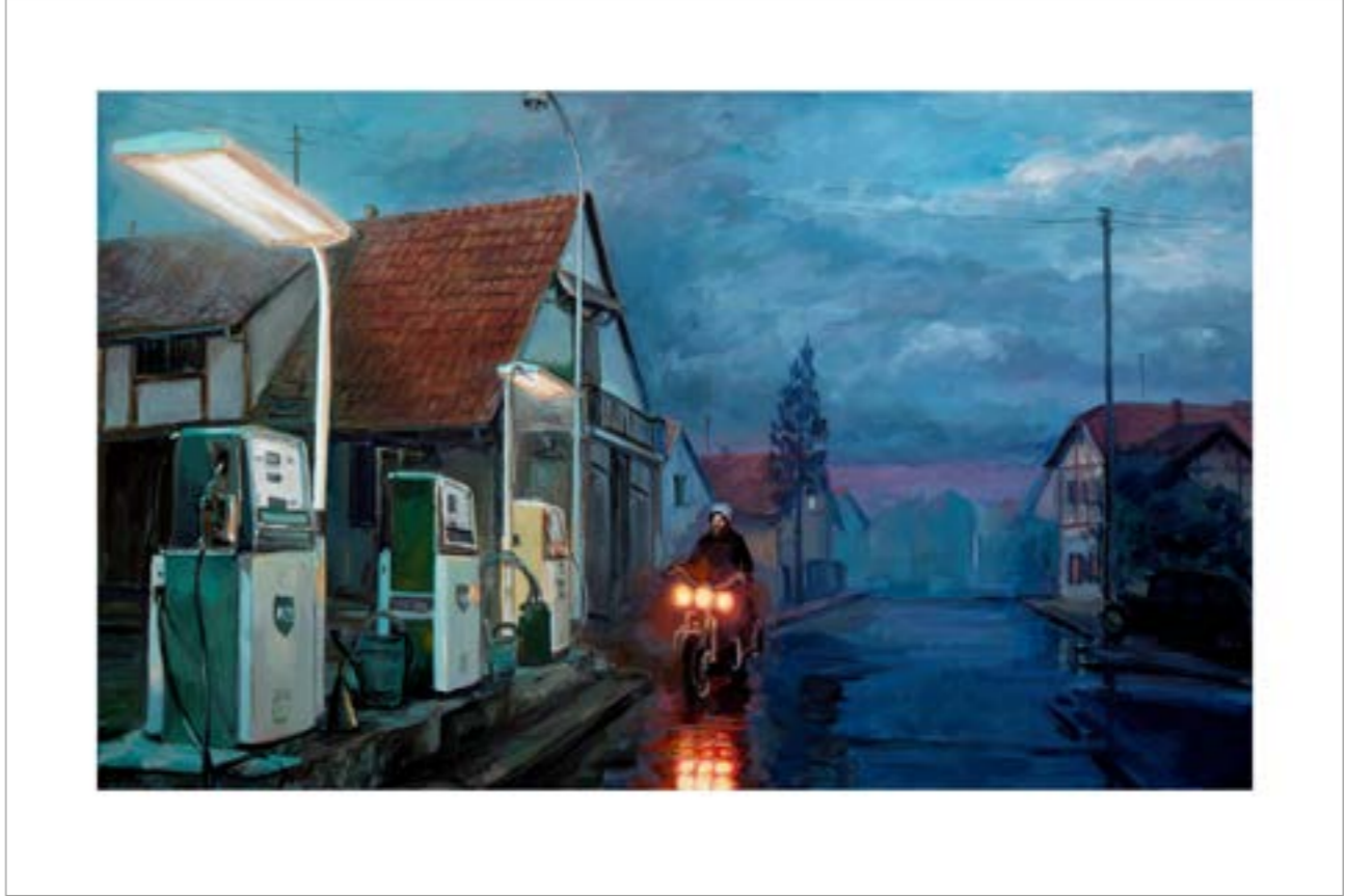
Edge of Town Limited Edition Graphics of 295 • Paper Size 44" x 29½" (112cm x 75cm) • Image Size: 38" x 23" (97cm x 58cm)