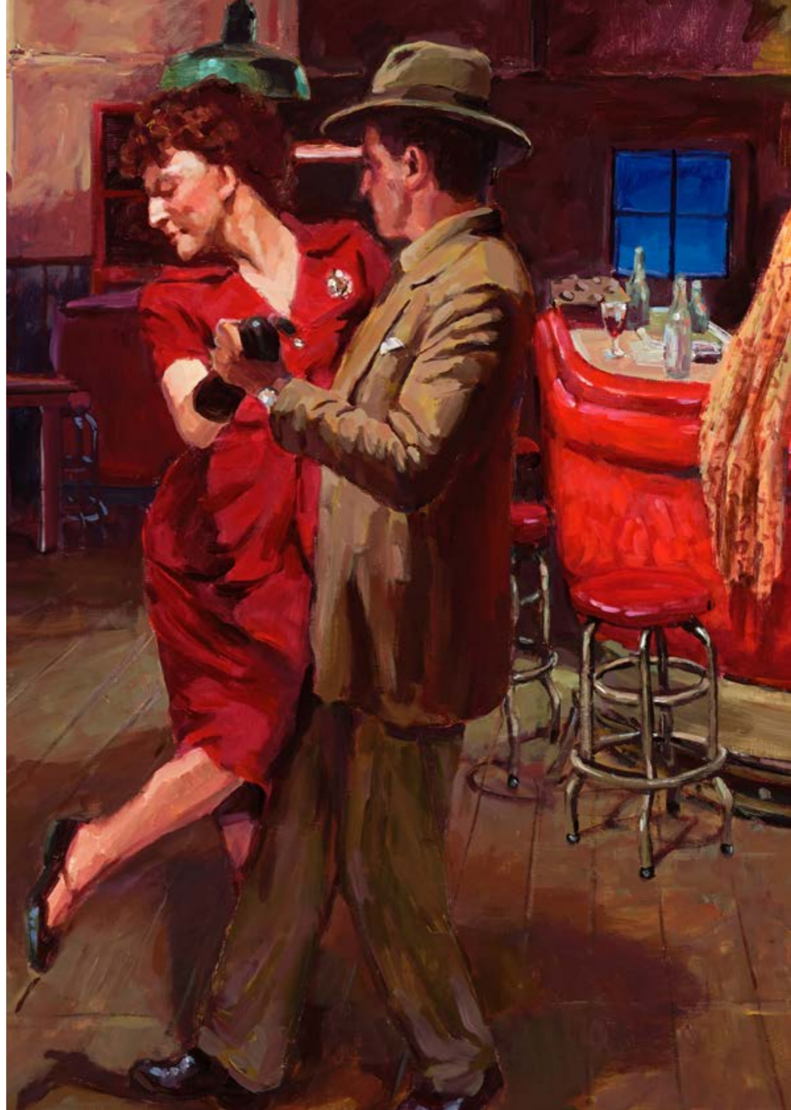
Tango Dancers Limited Edition Graphics of 295 • Paper Size 44" x 29½" (112cm x 75cm) • Image Size: 38" x 23" (97cm x 58cm)