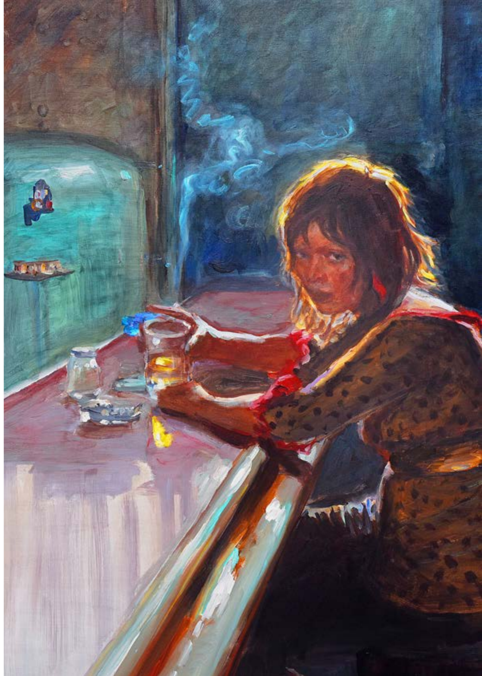
Hideaway Woman Limited Edition Graphics of 295 • Paper Size 40" x 31½" (102cm x 80cm) • Image Size: 34" x 25" (86cm x 64cm)